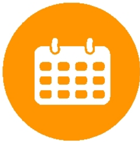
Buying and selling annual leave

We want to offer staff the most competitive benefits for working with us. We already benefit from our surroundings with six green flag recognised parks, extensive woodlands, excellent transport connections and a newly regenerated town centre, however all staff can make the most of the following: