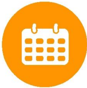
Buying and selling annual leave

We want to offer staff the most competitive benefits for working with us. We already benefit from our surroundings with six green flag recognised parks, extensive woodlands, excellent transport connections and a newly regenerated town centre, however all staff can make the most of the following: